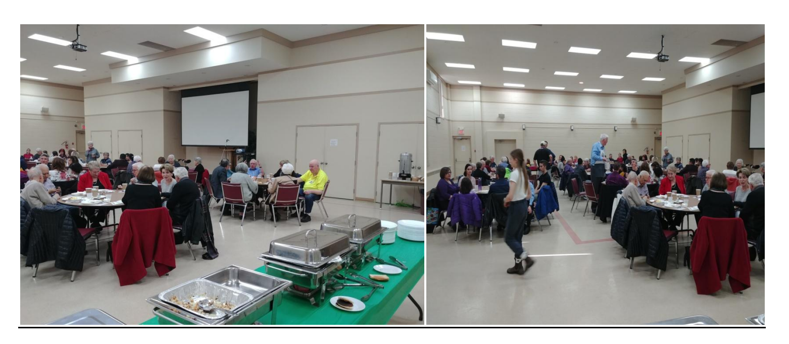
There were over 168 people who attended the parish breakfast between the 2 sittings after mass.