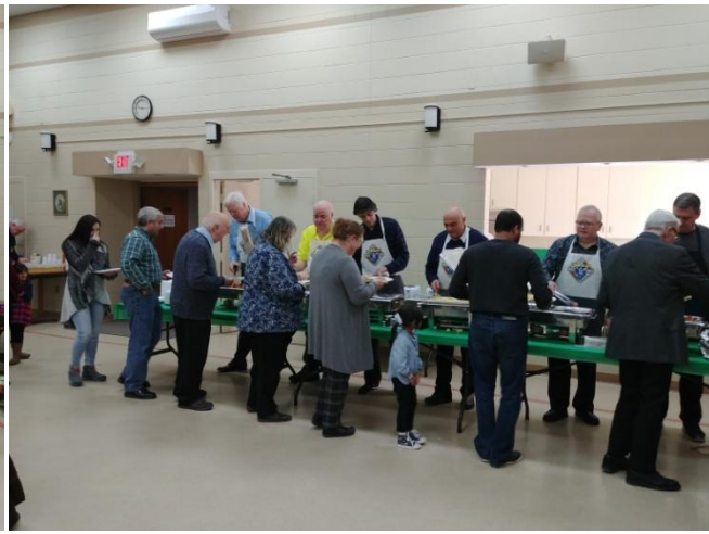
Brother Knights that were there to help serve the breakfast to all who attended